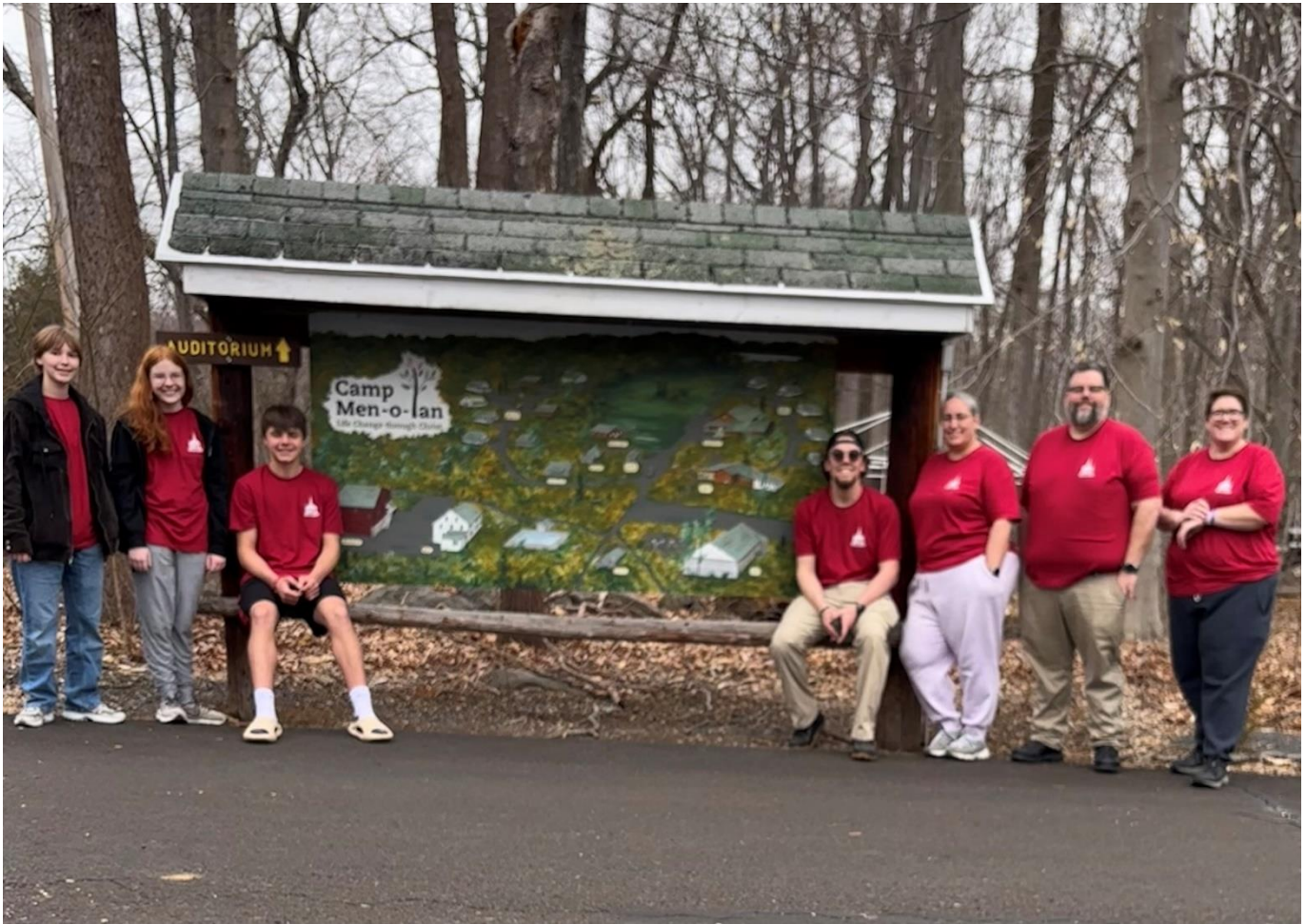
Group picture from the youth group retreat this past weekend.